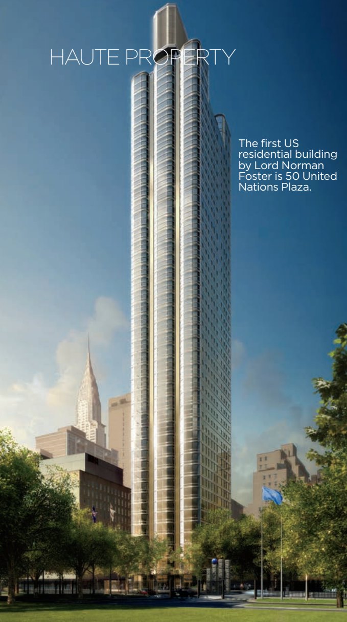
The first US residential building by Lord Norman Foster is 50 United Nations Plaza.

“The people shopping for these homes are looking for a very high level of service.” —DAN TUBB