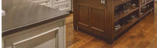
↑ PARK SLOPE 45 Montgomery Place 7 bedroom, 7 bath single family townhouse